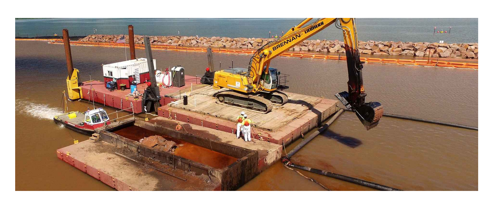
BARGE DREDGER WITH EXCAVATOR