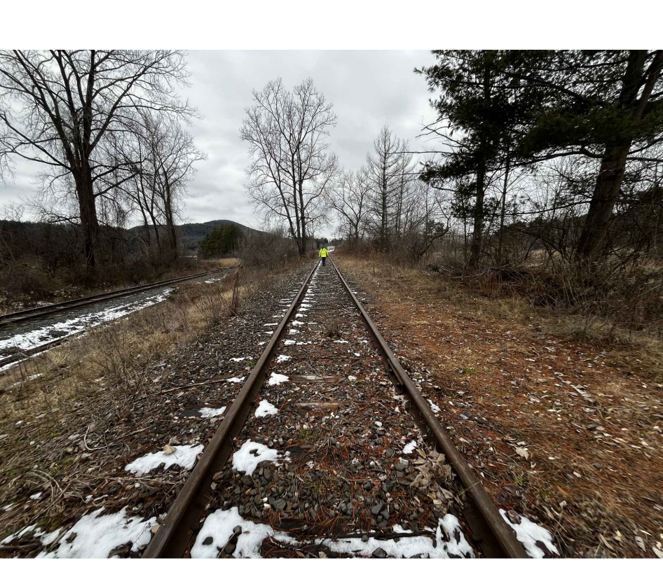
AREA SURROUNDING RAILROAD SIDING TO THE ONYX SPECIALTY PAPER FACILITY LOCATED AT 1075 PLEASANT STREET, LEE, ALONG REACH 7D