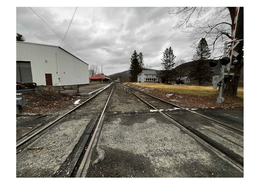
APPROXIMATELY 0.50 MILES OF RAILROAD SIDING ADJACENT TO THE BERKSHIRE SCENIC RAILWAY MUSEUM IN LENOX NEAR REACH 6