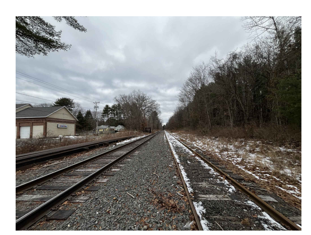
APPROXIMATELY 0.85 MILES OF RAILROAD SIDING ALONG VAN DEUSENVILLE ROAD, GREAT BARRINGTON, NEAR REACH 8