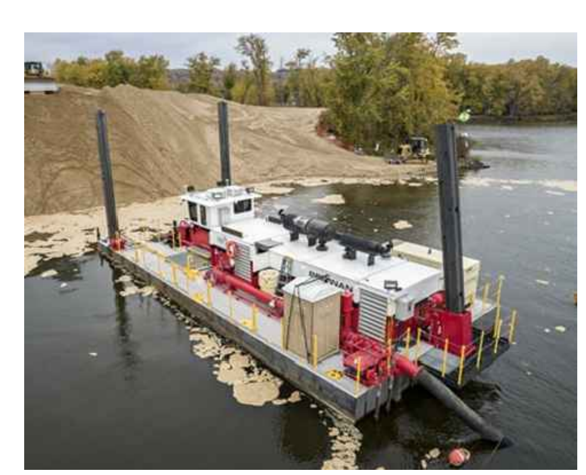
DREDGER WITH HYDRAULIC EQUIPMENT