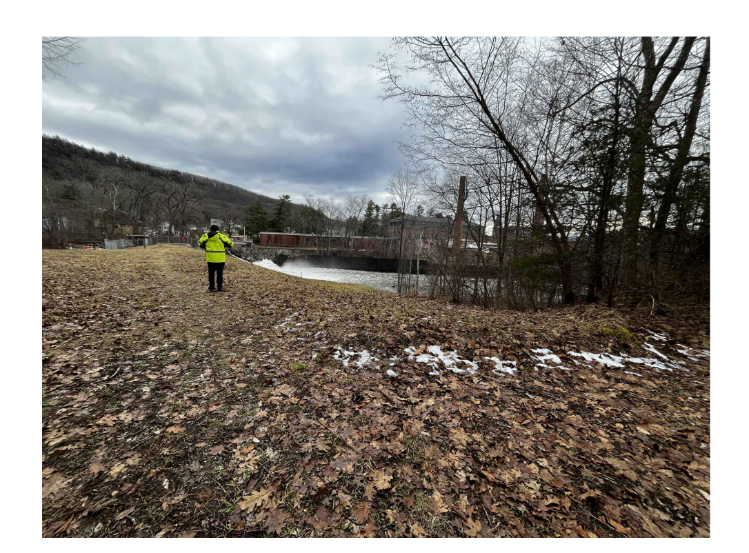
RISING POND DAM - ACCESS POINT TO HOUSATONIC RIVER FROM VAN DEUSENVILLE ROAD, GREAT BARRINGTON, RAILROAD SIDING IN REACH 8