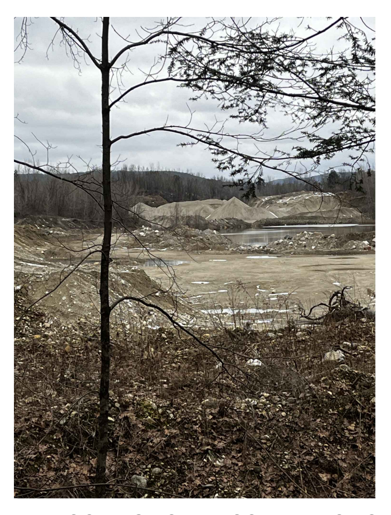
VIEW LOOKING TO THE SOUTHWEST OF THE UPLAND DISPOSAL FACILITY ALONG REACH 7A