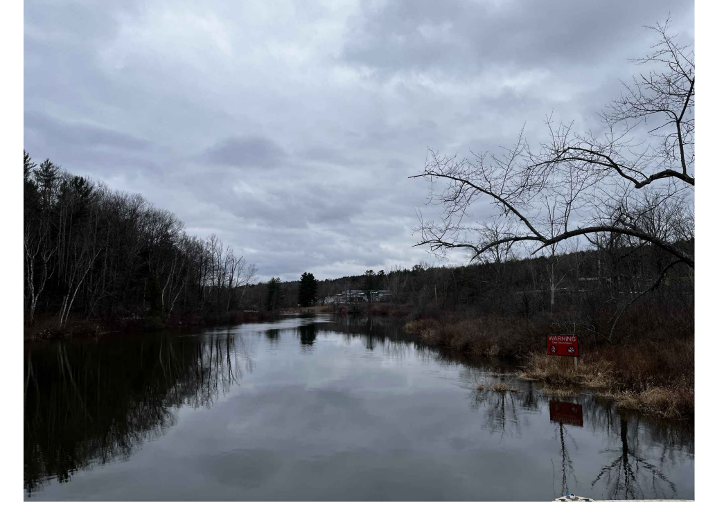
HOUSATONIC RIVER LOOKING SOUTH FROM THE PEDESTRIAN BRIDGE CROSSING IN LENOX (REACH 6)